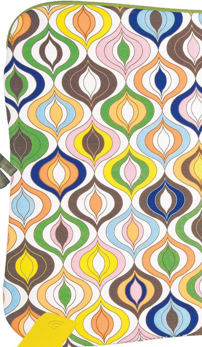
Jonathan Adler bargello-print laptop sleeve, $28.95 at Barnes & Noble