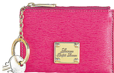
Lauren by Ralph Lauren Newbury leather key/coin case, $48 at Bloomingdale's