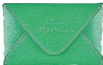
Lauren by Ralph Lauren Newbury leather card case, $38 at Bloomingdale's