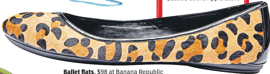
Ballet flats, $98 at Banana Republic