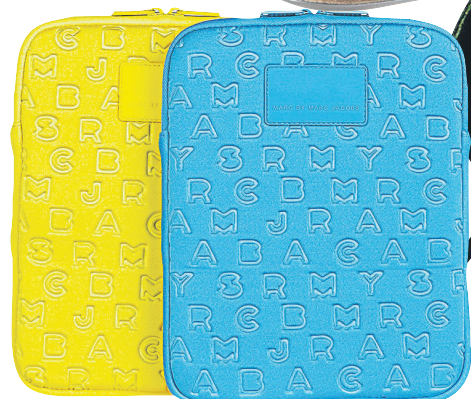
Marc by Marc Jacobs neoprene iPad covers, $38 each at Bloomingdale's