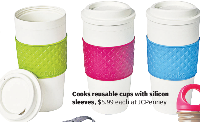
Cooks reusable cups with silicon sleeves, $5.99 each at JCPenney