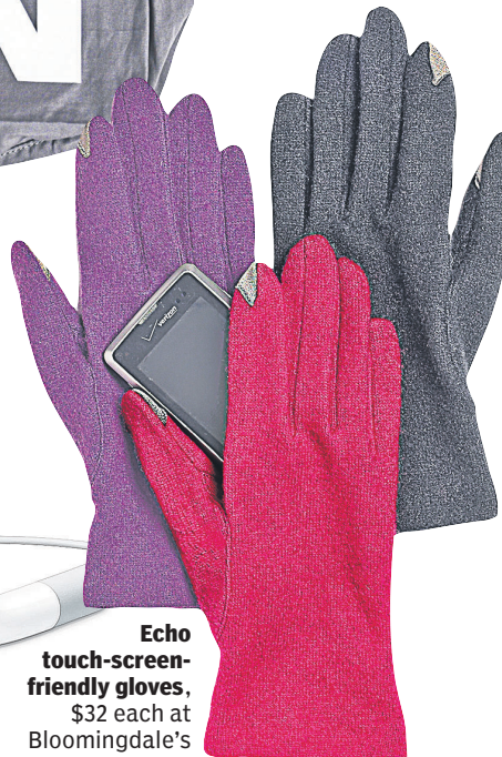
Echo touch-screen- friendly gloves, $32 each at Bloomingdale's