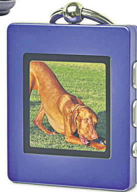
Sharper Image digital photo key chain, $12.99 at JCPenney