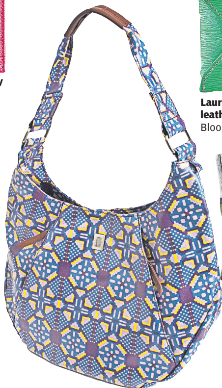
Coated canvas hobo bag, $64 at Brooklyn Industries