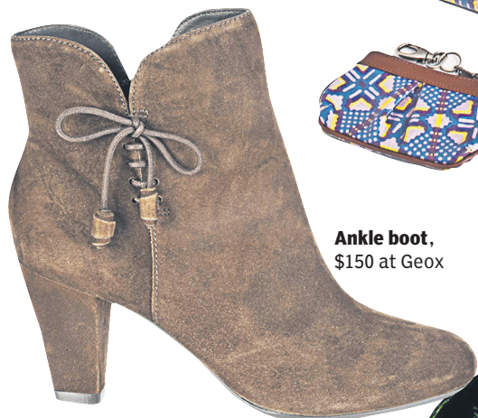
Ankle boot, $150 at Geox