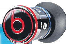
iBeats, by Dr. Dre from Monster, high-perform- ance in-ear headphone, $119.95 at the Apple Store