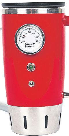
12V heated travel mug, $14.99 at JCPenney