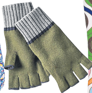
Men's fingerless gloves, $14.50 at Gap