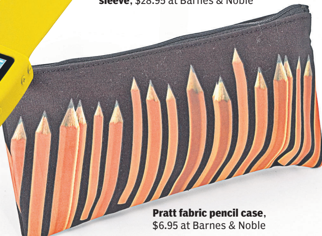
Pratt fabric pencil case, $6.95 at Barnes & Noble