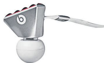
Heartbeats, by Lady Gaga from Monster, in-ear headphones, $149.95 at Best Buy