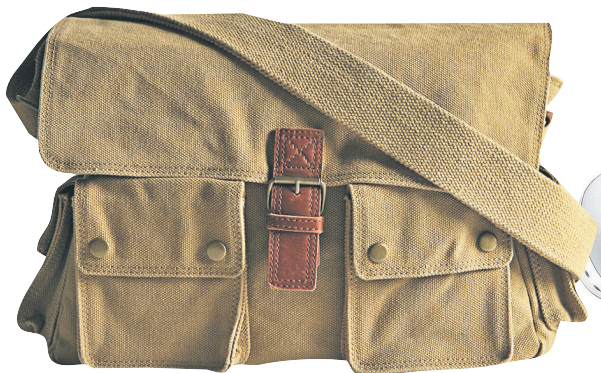
East West messenger bag, $48 at Urban Outfitters