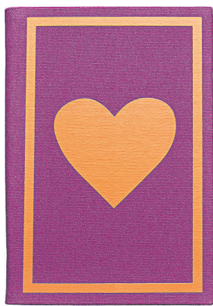
Jonathan Adler Peace & Love Nook cover, $29.95 at Barnes & Noble