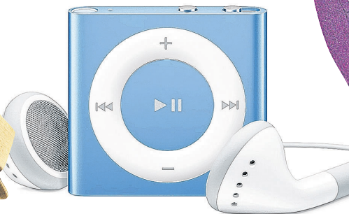
Apple Shuffle, $49 at the Apple store