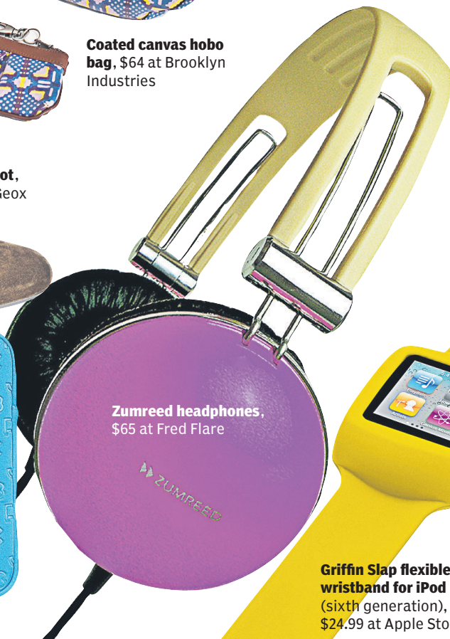
Zumreed headphones, $65 at Fred Flare